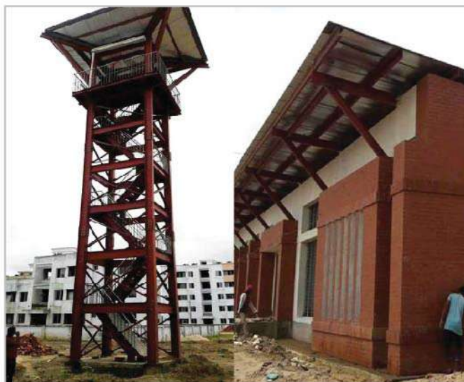
WATCH TOWER AND CAFETERIA SYLHET JAIL