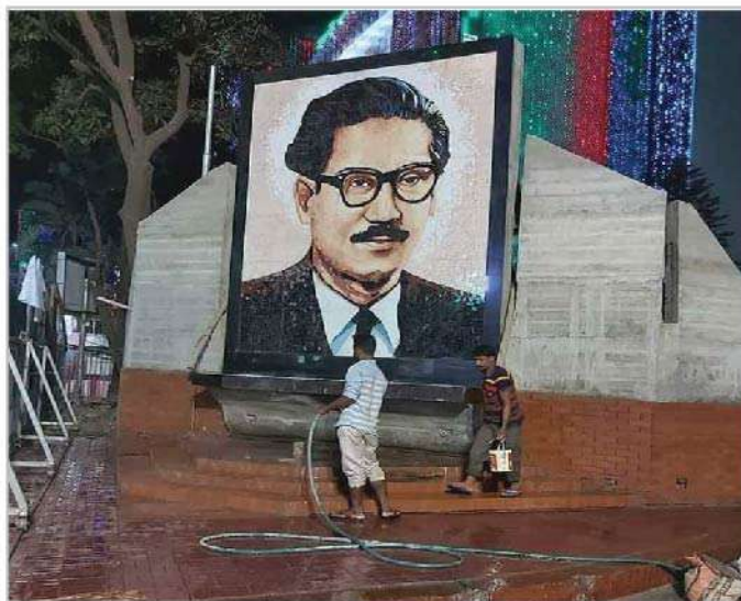
BANGHABANDHU MORAL SHILPOMONTRONALYOY