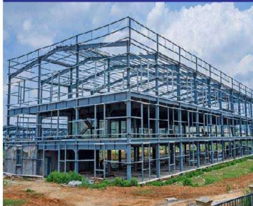
Steel Structure Design and Construction