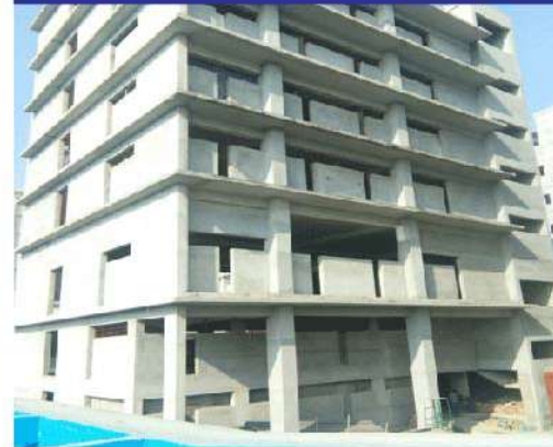
RCC Structure Design and Construction