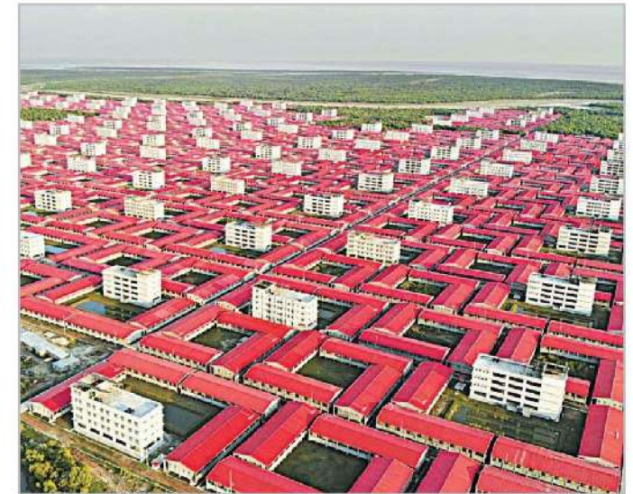
ROHINGA ASRAYAN PROKALPO VASHANCHAR