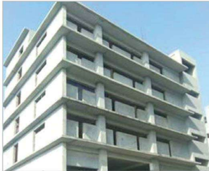
7 TH STORIED CHEMICAL BUILDING