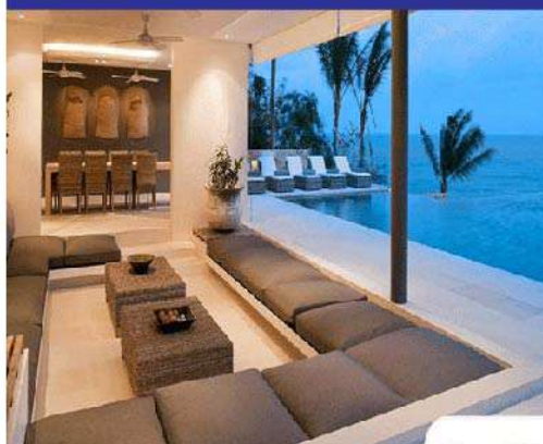
Interior and Exterior Decoration