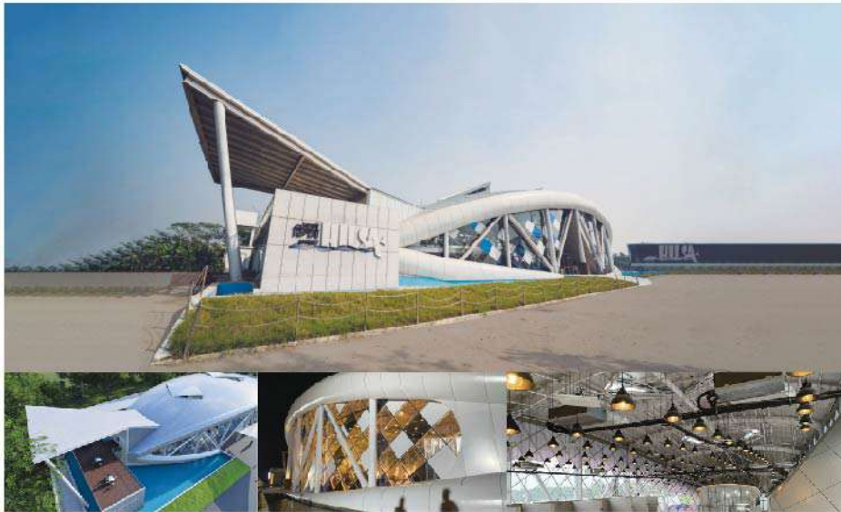
PROJECT HILSA MAWA