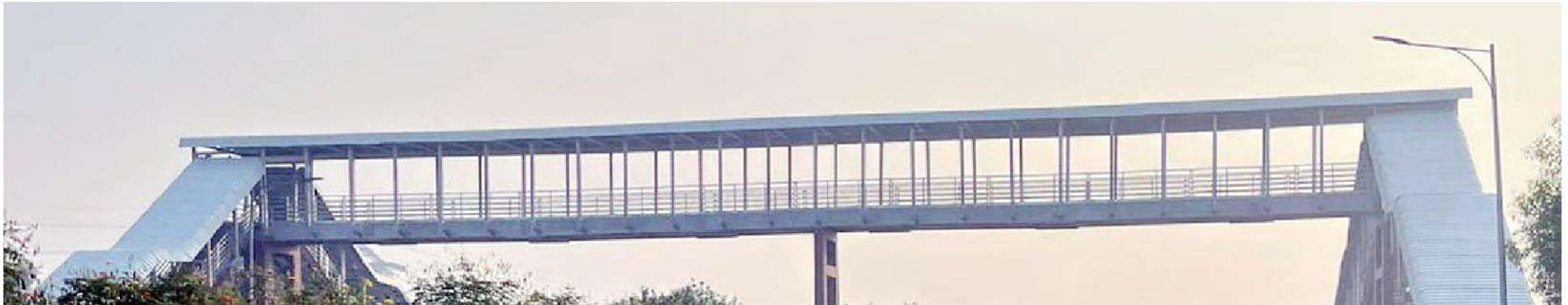
FOOTOVER BRIDGE AT VANGA EXPRESSWAY