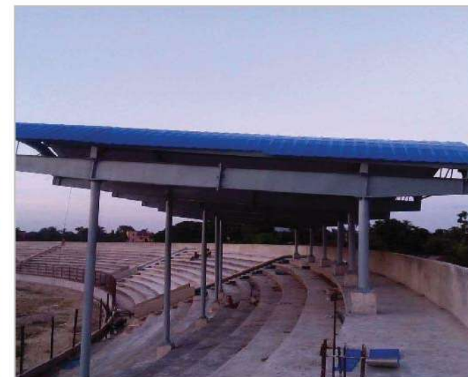
GALLERY SHED NETROKONA STADIUM