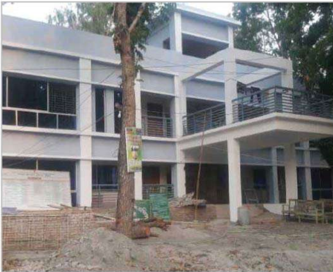
2 TH STORIED UPAZILA BHUMI OFFICE