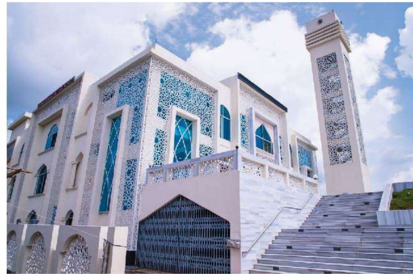
MODEL MOSQUE KISHORGANJ, NILPHAMARI