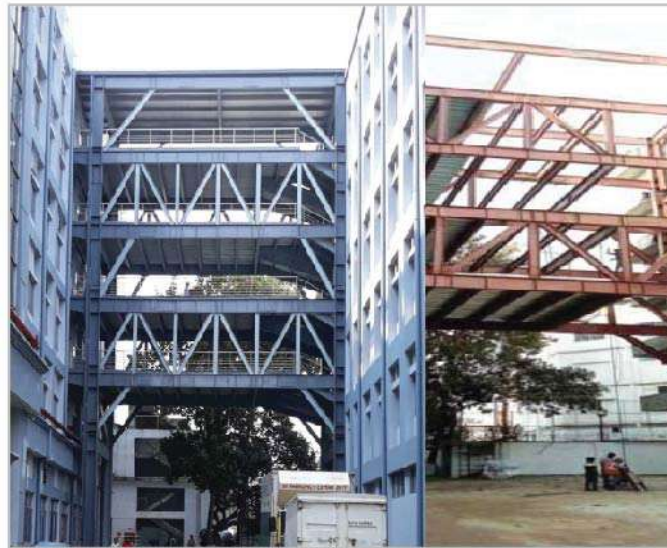
AJ SUPREME CONNECTING BRIDGE